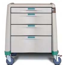
Sample: Light Crème with Extreme Green Fillers