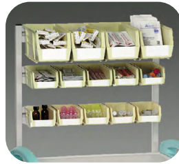
Bulk Storage Bins