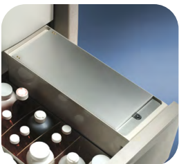
Internal Lock Box