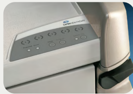
Keyless Access with Manual Relocking