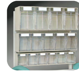
Tilt Bin Organizers