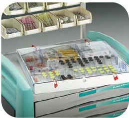
Divided Drawer Tray