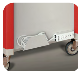
Plug Outlet Strip UL1363A Rated