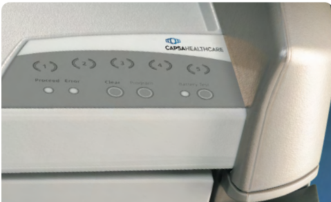
Keyless Access with Manual Relocking

Avalo's unique breakaway locking handle is standard on every model, offers the security you require and ensures quick access to code cart supplies