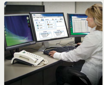
Standard Host Software

An advanced proximity card reader can be selected as an additional security access requirement