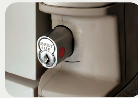
Key Access with Manual Relocking