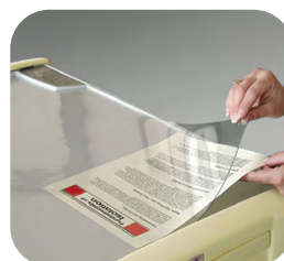
Clear Top Mat