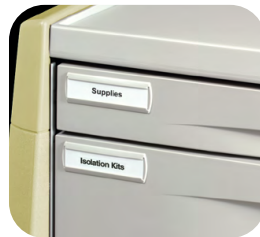
Drawer Tag Holder