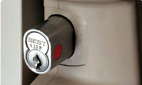
Key Access with Manual Relocking (standard)

Featuring the Best ® Core Removable Lock System, this basic yet proven lock system provides your medical cart advanced security and the flexibility to change keys simply and easily.