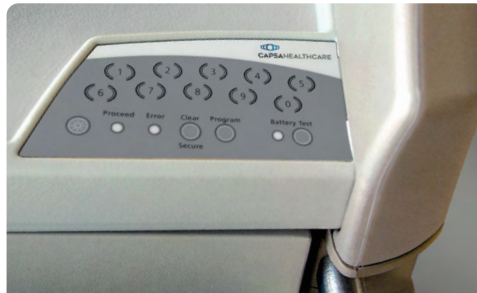
AutoLock ™ Automatic Relocking System

Simply enter a 4-digit access code, push down the lock lever and the cart is ready for access. To secure the medical cart, simply push in the lock lever. Clear visual indication of lock status is apparent from a distance.